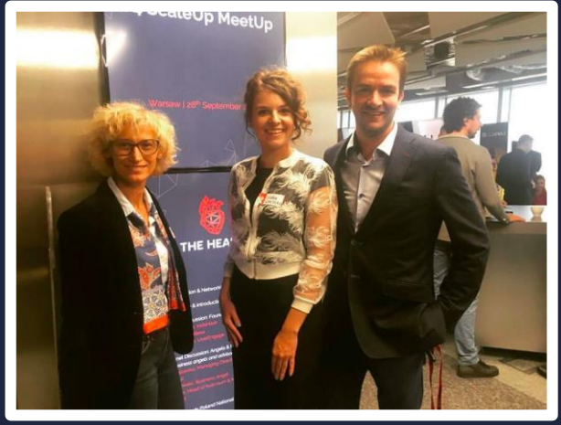
Founder of the Year Limitless