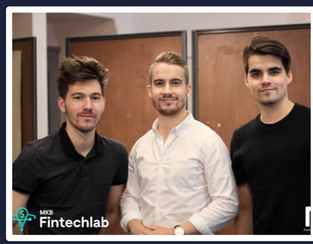
Telenor Accelerate Family Finances